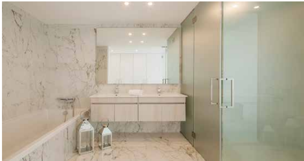
EXCEPTIONAL HOMES. UNIQUE ENVIRONMENTS